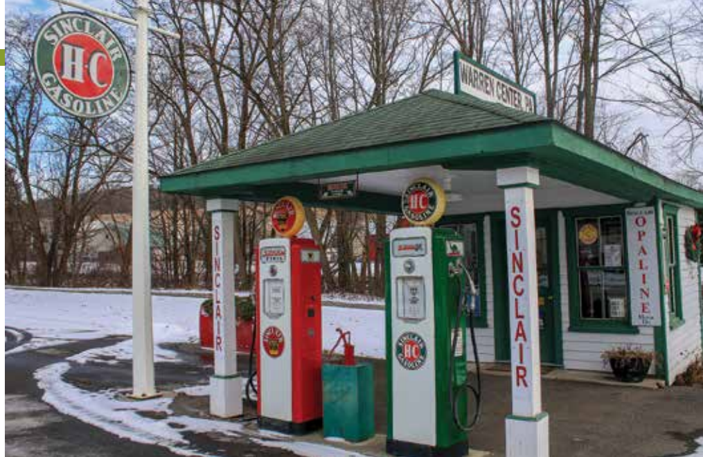
REMEMBER WHEN: Claverack member Jeff Treadwell restored the gas pumps and helped construct this replica Sinclair gas station located in Warren Center in northeastern Bradford County.

public property within the tiny village. They enlisted Treadwell’s help for the project.