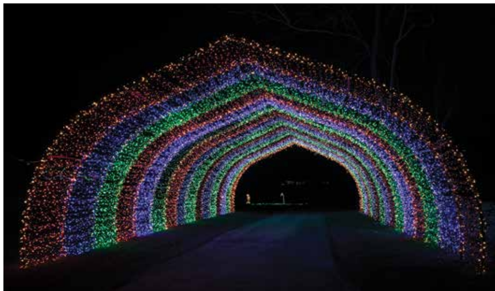
TUNNEL OF LIGHT: A colorful archway, constructed using an old greenhouse as a frame and 800 strands of LED lights, served as the gateway to the 2017 Festival of Lights display at Stone Hedge. The nightly festival, which features over 16,000 strands of energy-efficient LED bulbs and scores of additional fabricated light displays, is open daily, except for Christmas Eve, through Dec. 31.

Force, who coordinates the set up along the drive-through loop, takes a hands-on approach to the Festival of Lights. She helps string lights and