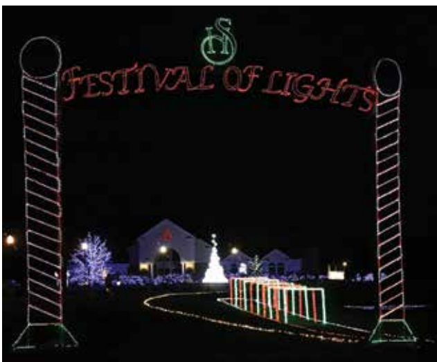
GRAND ENTRANCE: The entrance to the Festival of Lights at Stone Hedge as it appeared in 2017. While Claverack provides electricity to the golf course clubhouse, the drive-through light display, which covers a two-mile loop on the golf course's back nine, is powered by three large diesel generators.

She notes that two tractor-trailer loads of new display items have been added for this year's Festival of Lights, which will operate daily, except for Christmas Eve, through Dec. 31. Characters from the Peanuts cartoon, heavy equipment and an outer space exhibit